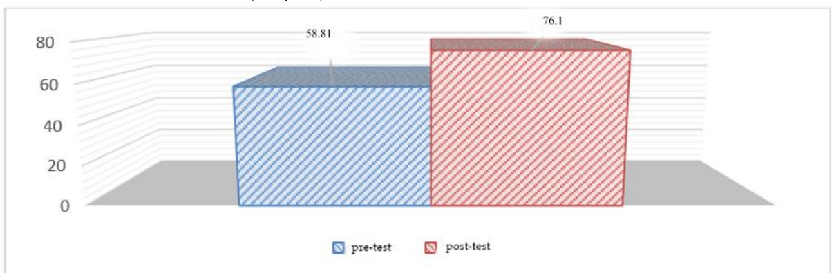
Graph 1. Pre- and Post-test Mean Scores of the Experimental Group

The mean scores of the Social Acceptance Attitudes Scale of the students in the experimental group were found to be 58.81 before the story-reading activity and 76.10 after the story-reading activity; the differences between the pre-test and post-test mean scores were found to be in favor of the post-test at a level of p<0.05. This finding indicates a significant difference between the Social Acceptance Attitudes Scale pre-test and post-test scores of the experimental group in favor of the post-test score. The Social Acceptance Attitudes Scale scores of the students in the experimental group therefore indicated an increase after the intervention (Graph 1).