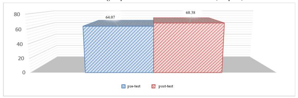
Graph 2. Pre- and Post-test Mean Scores of the Control Group

The Social Acceptance Attitudes Scale mean scores of the students in the control group were found to be 64.07 before the reading activity and 68.38 after it; the differences between the pre- and post-test scores were found to be significant at a level of p<0.05 in favor of the post-test. This finding indicates a significant difference in the control group students' Social Acceptance Attitudes Scale pre- and post-test scores in favor of their post-test scores. There was therefore an increase in the Social Acceptance Attitudes Scale scores of the control group students after the intervention (Graph 2).